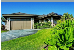
19 Photos Available