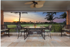
16 Photos Available