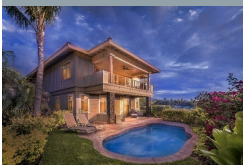
23 Photos Available