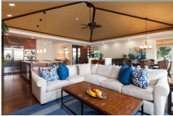
14 Photos Available