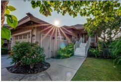
25 Photos Available