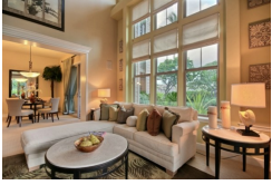
21 Photos Available