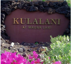
12 Photos Available