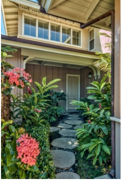
18 Photos Available