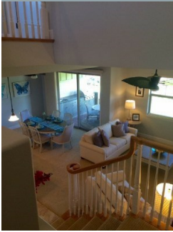
12 Photos Available