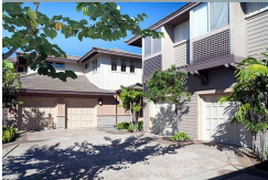
25 Photos Available