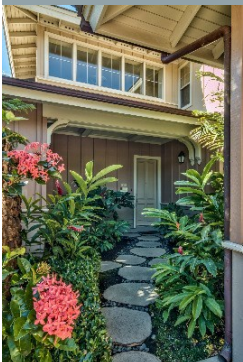
18 Photos Available