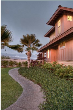
15 Photos Available