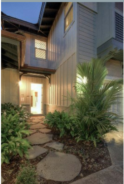
16 Photos Available