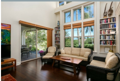
25 Photos Available