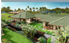
11 Photos Available