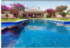
10 Photos Available