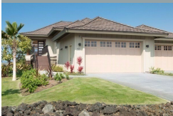
15 Photos Available