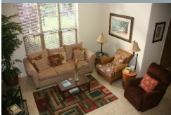
22 Photos Available