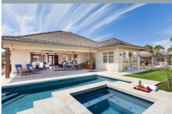
14 Photos Available