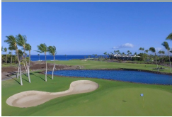
24 Photos Available