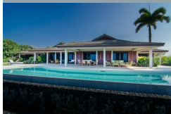
24 Photos Available