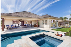
12 Photos Available