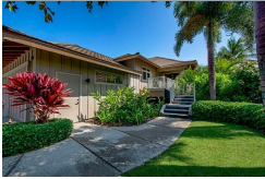
17 Photos Available