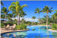
25 Photos Available