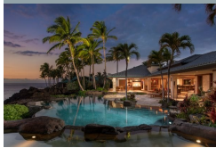
25 Photos Available