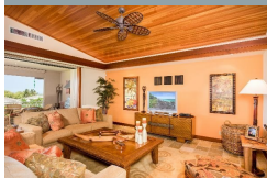
23 Photos Available