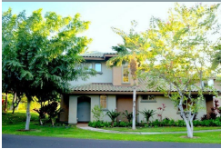
25 Photos Available