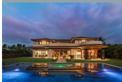
5 Photos Available