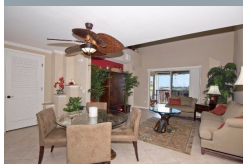
25 Photos Available