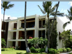
1 Photos Available