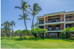
22 Photos Available