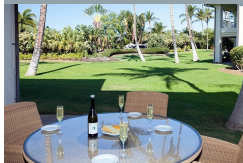
25 Photos Available