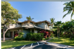
16 Photos Available