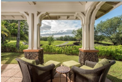
25 Photos Available