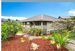
24 Photos Available