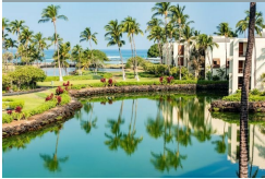
21 Photos Available