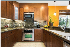
25 Photos Available