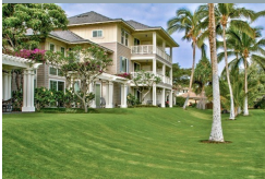
25 Photos Available