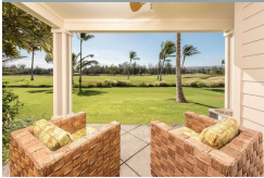
20 Photos Available