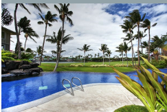
15 Photos Available