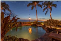
19 Photos Available