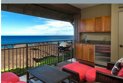
18 Photos Available